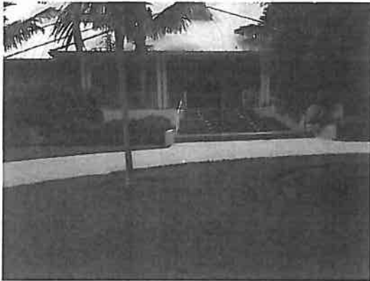
FRONT VIEW 7-26-11

If using the Elevation Certificate to obtain NFIP flood insurance, affix at least two building photographs below according to the instructions for Item A6. Identify all photographs with: date taken; "Front View" and "Rear View"; and, if required, "Right Side View" and "Left Side View." If submitting more photographs than will fit on this page, use the Continuation Page on the reverse.