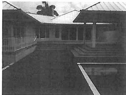
REAR VIEW 7-26-11