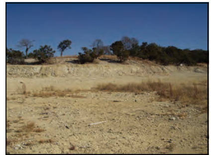
Gravel pit on site

Directions to: CR 278 Liberty Hill TX 78642 Contact agent for directions and access instructions